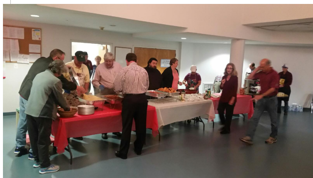
The serving line!