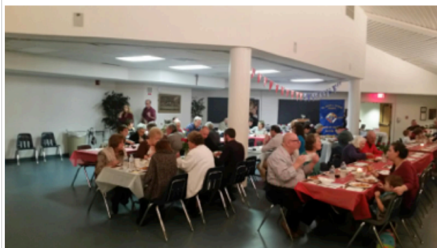
More Happy Customers